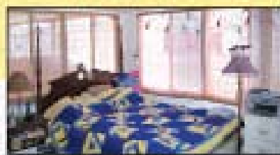
Spacious and Versatile Sunroom